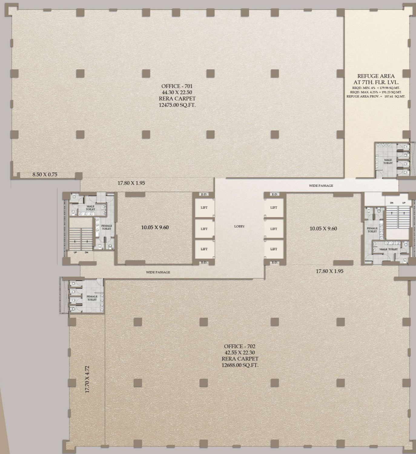
7 TH FLOOR PLAN