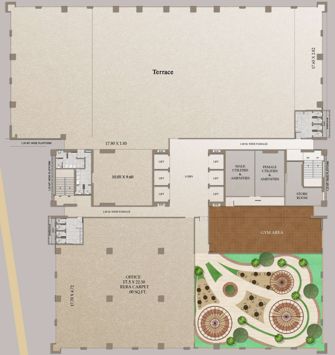
12 TH FLOOR PLAN